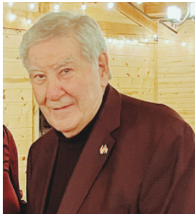
Senator Lou D'Allesandro